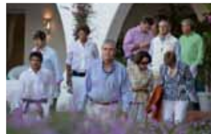
Owners and guests sip champagne, enjoying the view from the gardens of the Romazzino Hotel; once the sun went down and dinner was finished it was time to let loose on the beachside dance floor