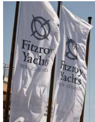
Clockwise from top: the Fitzroy flags fly proud for Day 2 – Fitzroy Race Day; Edoardo Recchi, the YCCS Director of Sport, welcomes owners and skippers; all hands to douse Indio's spinnaker; Open Season enjoys classic conditions on the windy third day of racing