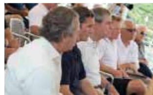
Clockwise from middle: a close call for Kalikobass II ; the foredeck crews had their work cut out in heavy conditions; skippers and owners at the pre-regatta briefing; Saudade on a charge